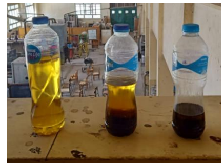
our Bio-Diesel product (manual trail)

Arduino and some electrical components for the automation (motors, relay, motor driver,...etc.)